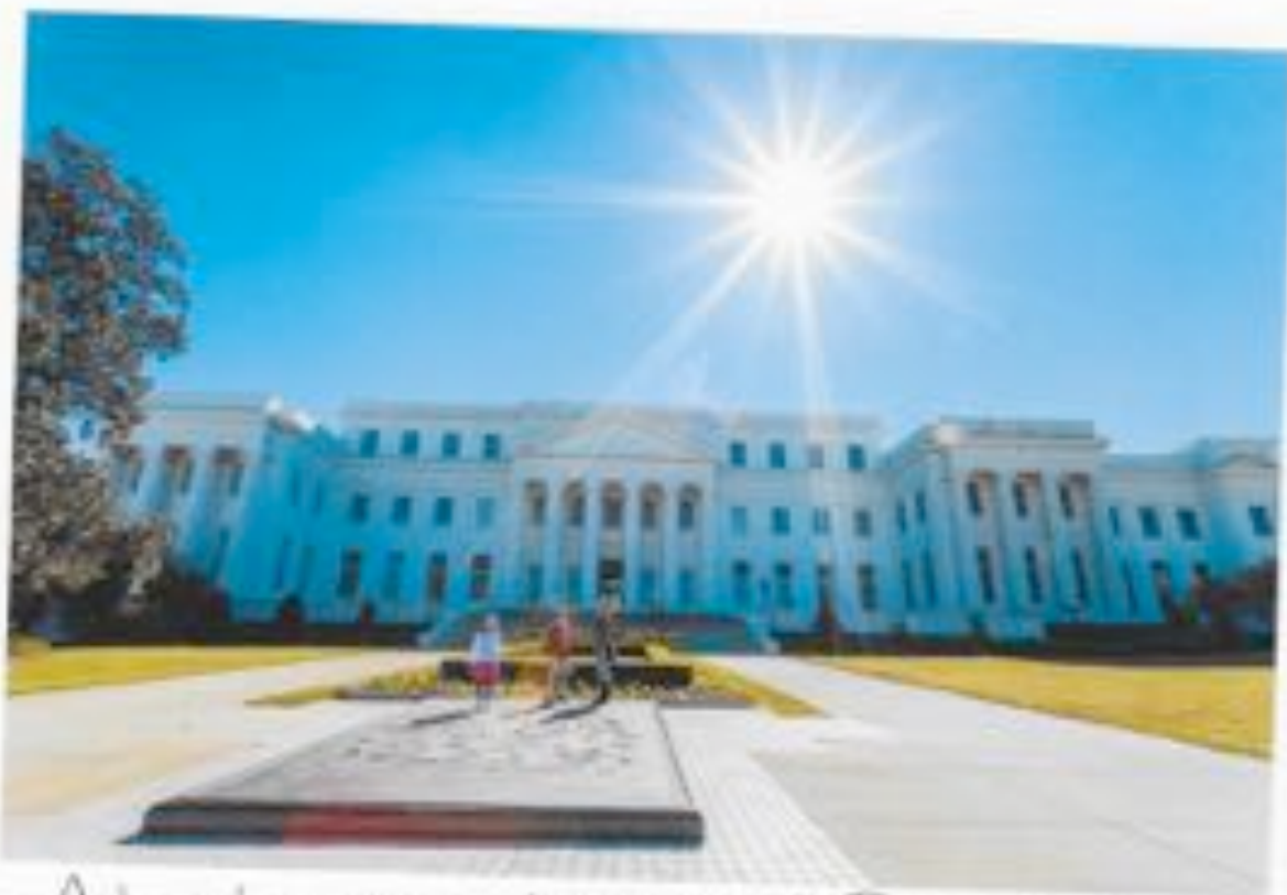
Alabama Department of Archives and History