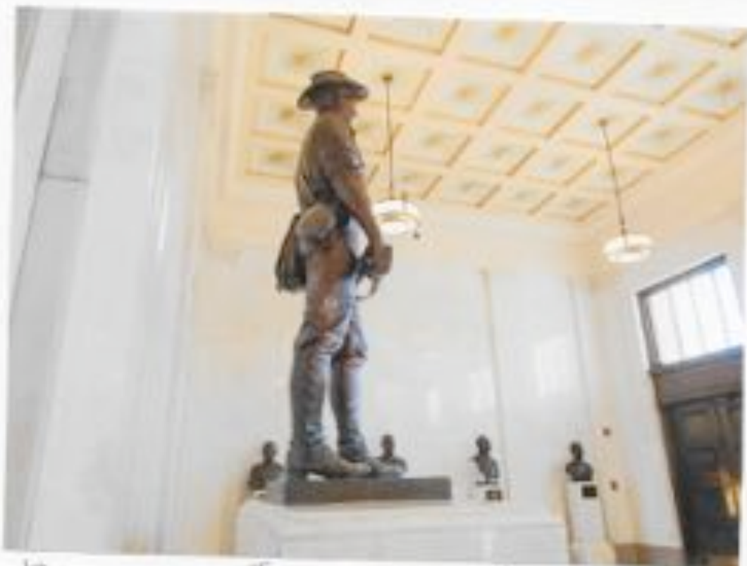
my pictures of the lobby